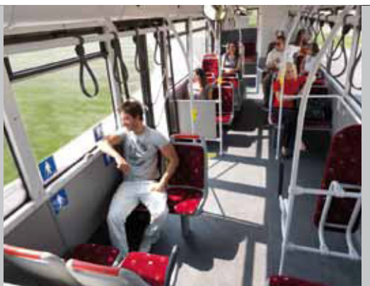
Well laid-out and generously proportioned interior with comfortable seats and safety-grip handrails