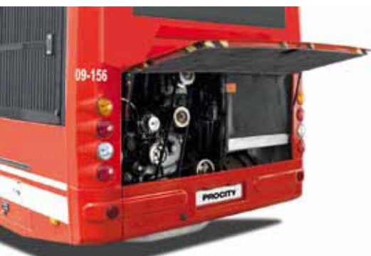
285 or 320 PS Cummins common-rail engine in Euro 5, fitted at the rear left-hand side for a more spacious interior