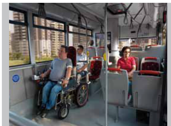
Manual foldable ramp and wheelchair space enhance easier access for disabled passengers and prams