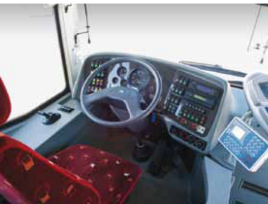
Ergonomically enhanced driver's cabin with all instruments, switches and displays positioned within driver's field of vision