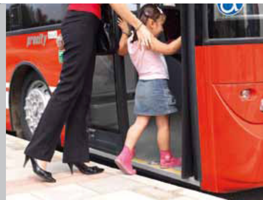
Kneeling function and walk through super low floor for easy passenger entry and exit